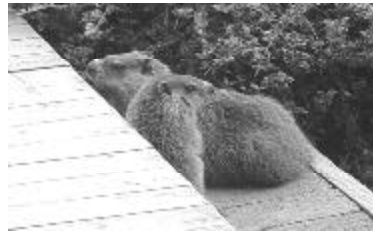
New YWA staff members who declined our request to submit biographical information.

My work at YWA over the last two years has been an invaluable learning experience. I am taking away many tools and experiences that will change the way I interact with others and the direction in which I choose to focus my future work. I feel fortunate to have had the opportunity to interact with many unique individuals who are working hard to sustain our forests for future generations. The greatest lesson I learned at YWA is that it is possible to change the way people interact and how they see the forest.